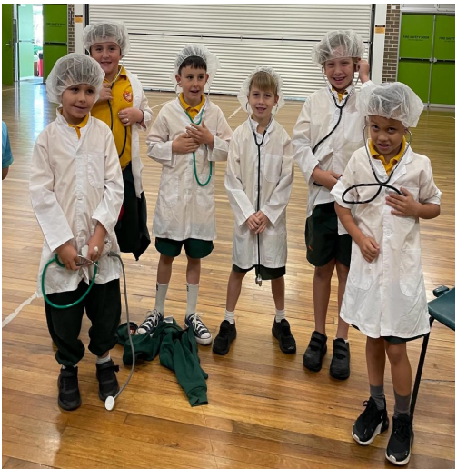
Classes Nirimba and Mundu enjoyed an interactive virtual tour of Sutherland Hospital earlier this week.