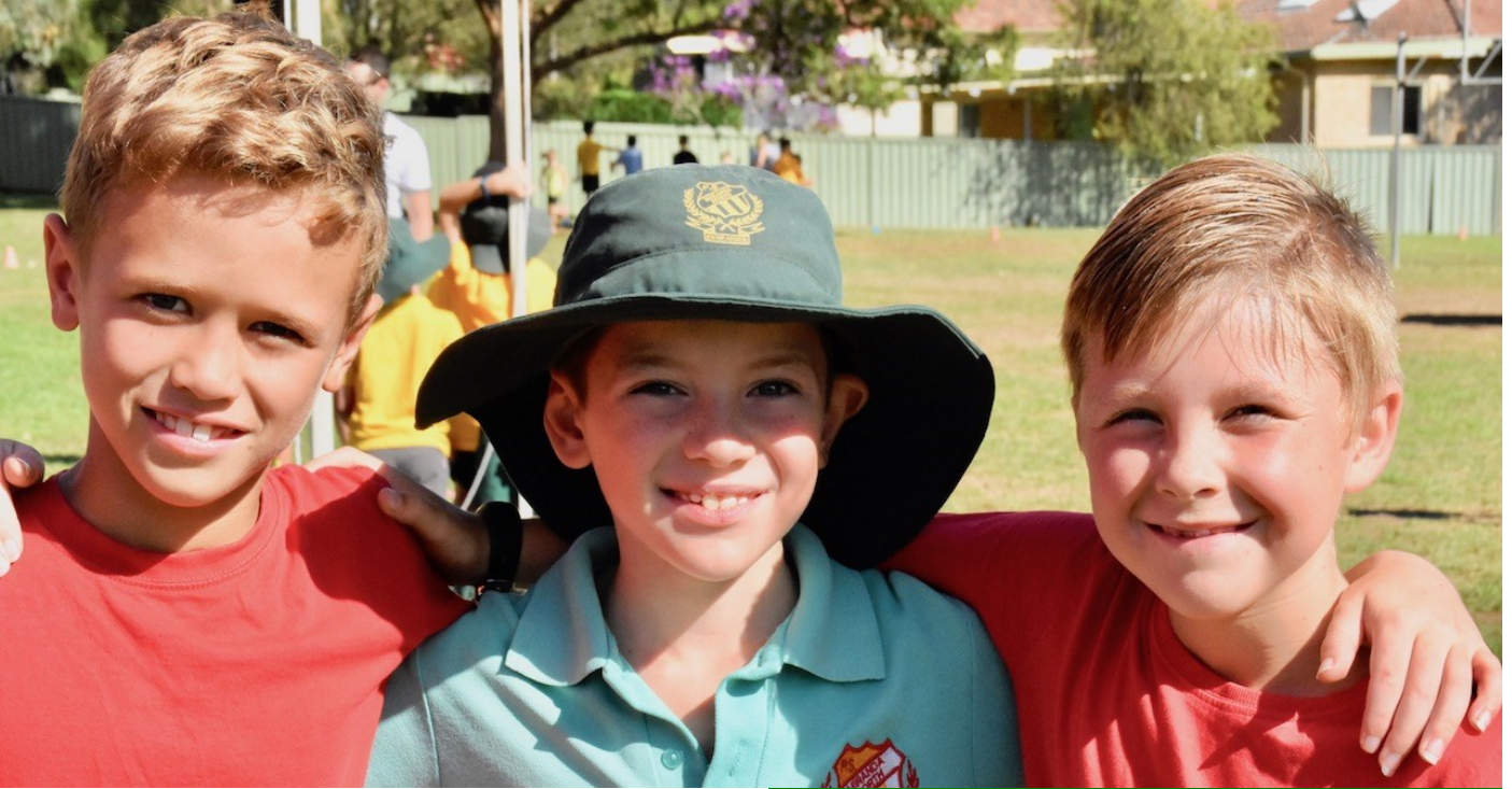
Student Photos Wed 2 May—Week 1 Term 2

Students need to wear full school SUMMER uniform on photo day with black shoes. Girls need to wear either hair colour, green or white coloured clips/ribbons/elastics in their hair if choosing to do so. If you wish your child to have a sibling photo please collect an envelope from the office and have your child return it on photo day. Envelopes must be returned with your child on photo day. Remember to bring along a big smile!