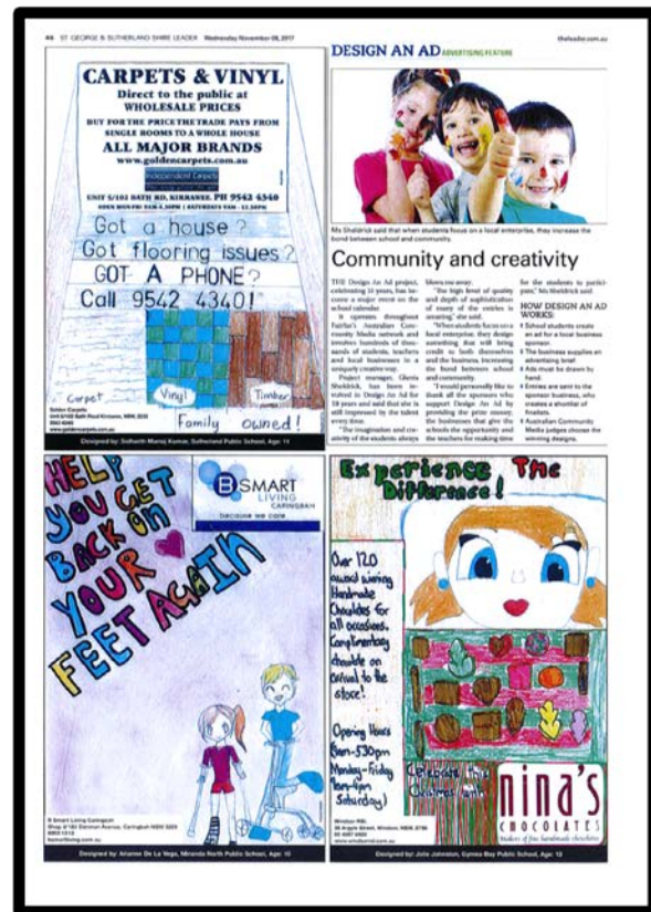
The successful artworks!