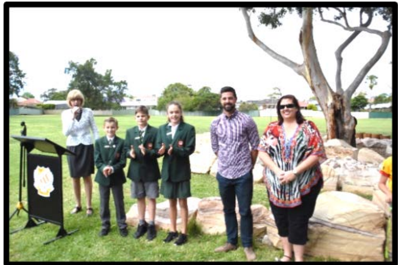
Our student leaders and P and C at the opening

came along and joined the staff for morning tea. It was terrific to celebrate with you!